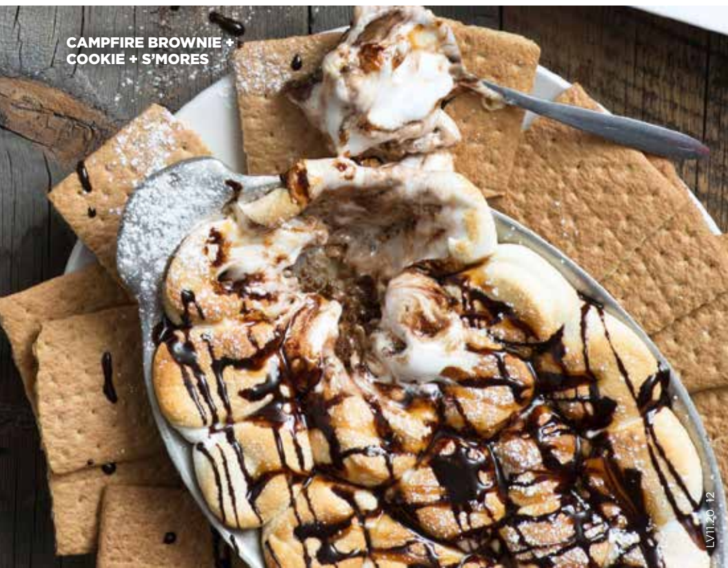
CAMPFIRE BROWNIE + COOKIE + S'MORES

Rich, creamy New York-style cheesecake, graham cracker crust drizzled with raspberry coulis 10